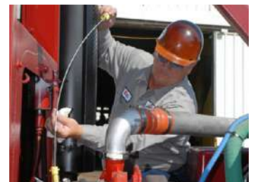
Easily Accessible Daily Checks