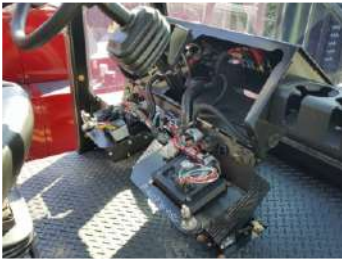
Flip-down Dash with Color/Number Coded Wiring (Standard)

Taylor Lift Trucks are designed with ease of maintenance and serviceability as a key priority. With today's engine and emissions requirements, daily maintenance checks and timely periodic service are the key to your equipment's longevity. All daily checks across the Taylor product line can be accessed from the ground or running board, ensuring that operators can complete these requirements with ease. Also, the sliding hood (on rollers), side service doors and removable floor panels open to expose the drive train and hydraulics to provide easy access for service and inspection.