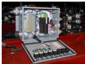
Heavy Duty Circuit Breakers/Reset Switches (Standard)