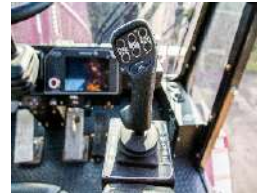
11 Button Command Joystick (Standard)