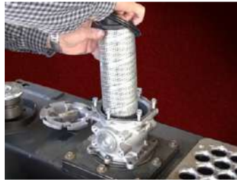
Spin-on Breather, Wire Mesh Strainer & Replaceable Internal Element (Standard)