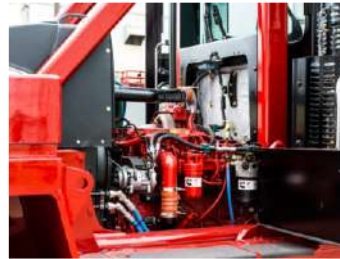
Easy Access to Drive Train & Hydraulics