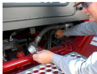
Service & Inspection from Ground Level