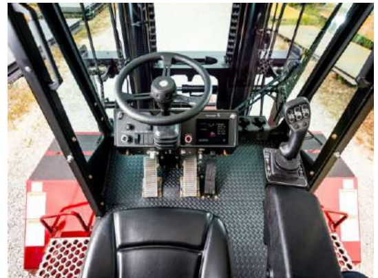
Fully Enclosed 2-Door Cab with Multiple Climate Control Configurations Available (featured cab is shown with available options)