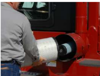
Donaldson Air Cleaner with Safety Element (Standard)