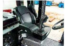
Fully Adjustable Mechanical Seat (Standard)