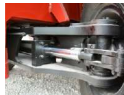
Industry's Toughest Steer Axle (Standard)