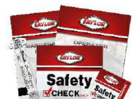
Safety CHECK Vehicle Information Package (Standard)